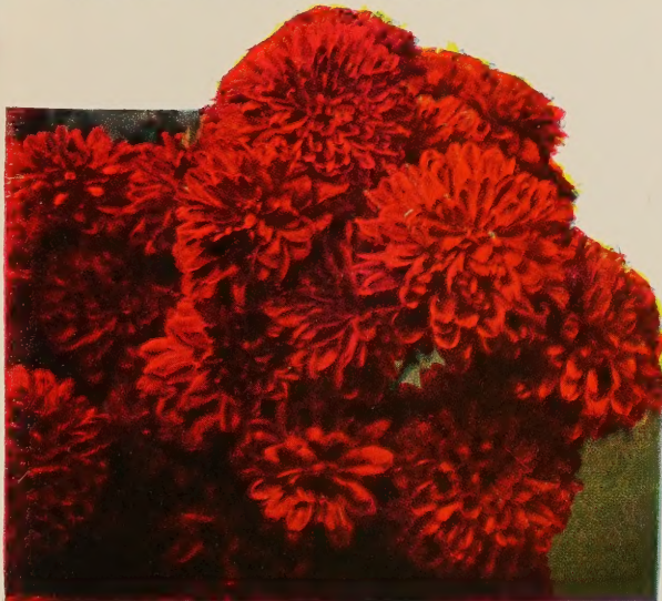
EARLY CRIMSON. 60c each; 3 for $1.50